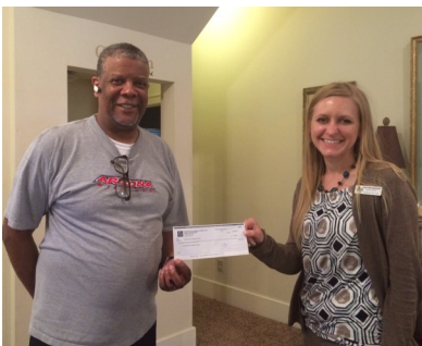
Council Donation to Central Texas Coalition for Life