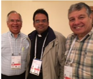
Our parish and Knights of Columbus Council among best represented at 2015 Central Texas Catholic Men's Conference