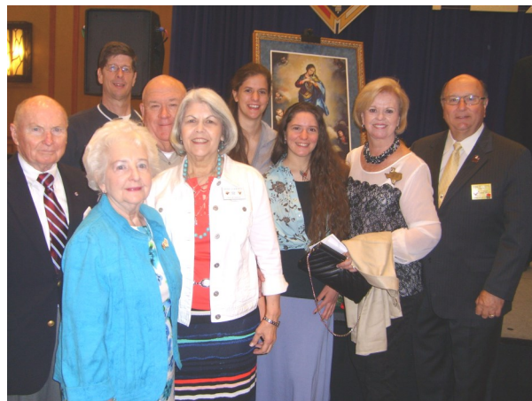
Your Council Representatives at the State Convention