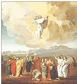
Ascension of the Lord June 1