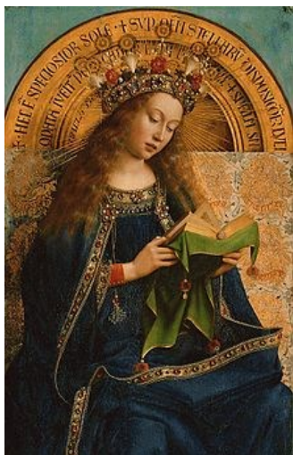
Solemnity of Mary, the Holy Mother of God